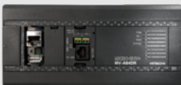
RS485 2-wire interface option